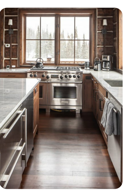
Big Sky 90 | Page 3 of 8