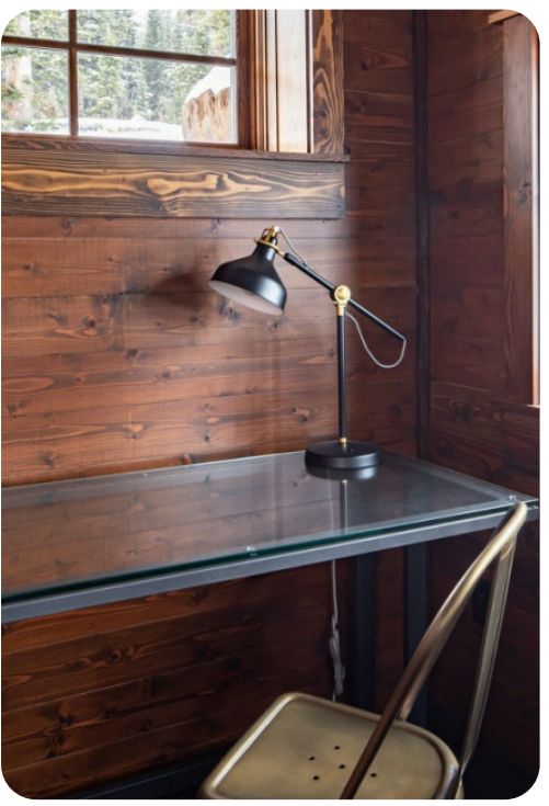
Big Sky 90 | Page 8 of 8