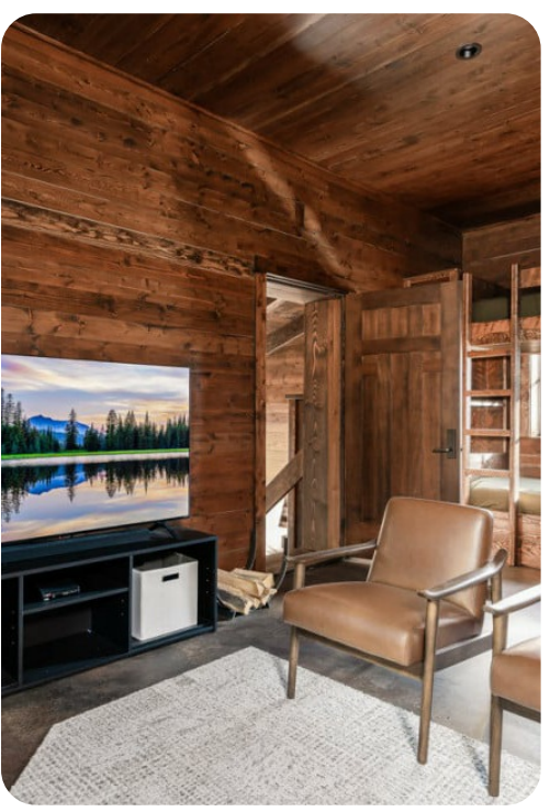
Big Sky 90 | Page 7 of 8