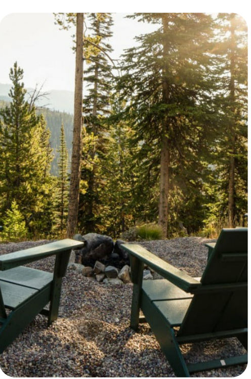
Big Sky 90 | Page 2 of 8