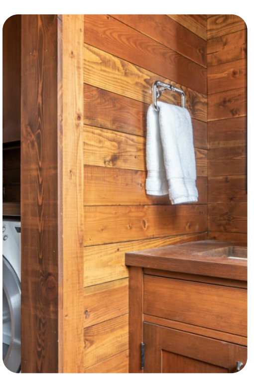
Big Sky 90 | Page 6 of 8