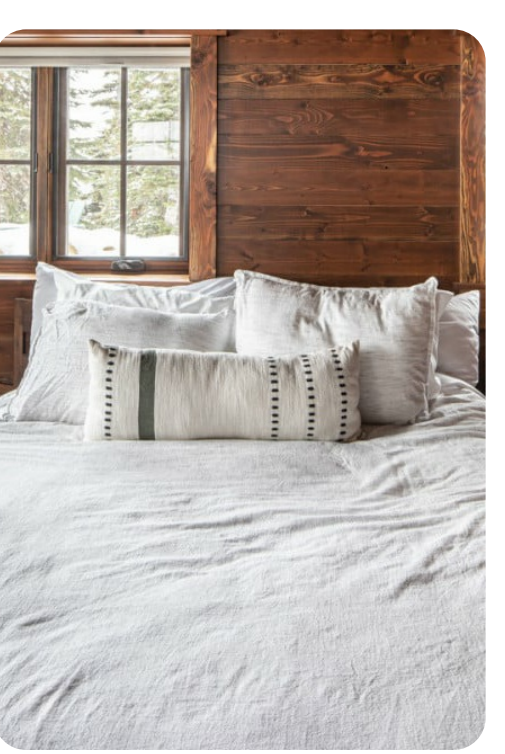
Big Sky 90 | Page 5 of 8