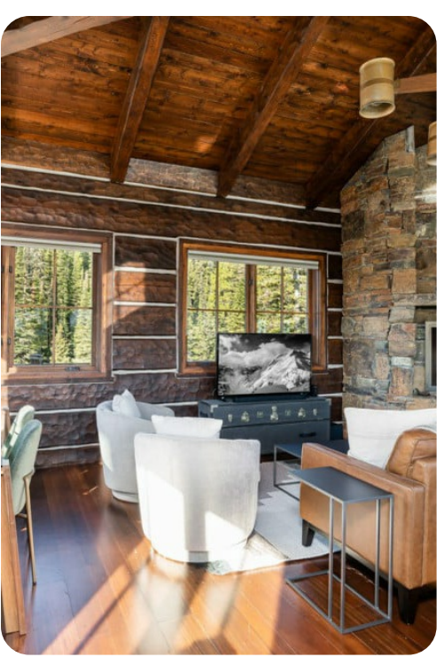
Big Sky 90 | Page 4 of 8