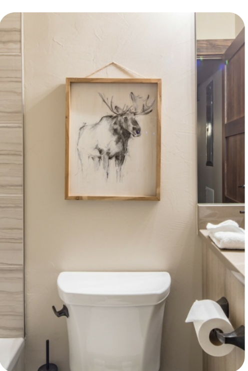
Big Sky 41 | Page 8 of 8