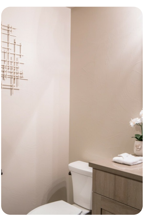
Big Sky 41 | Page 7 of 8