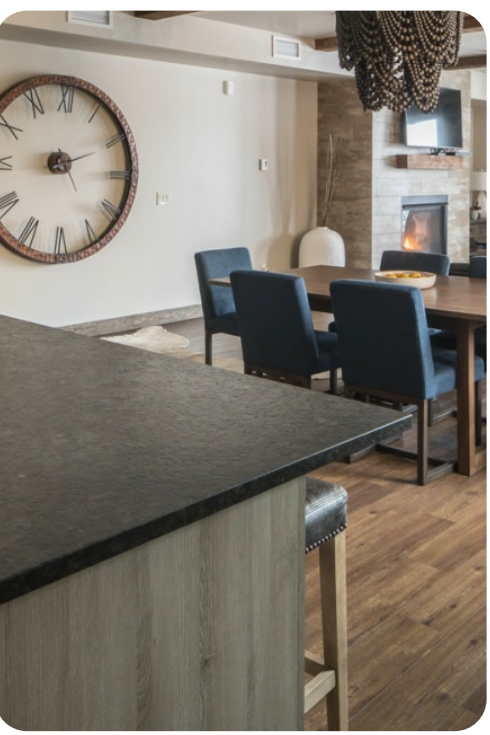
Big Sky 41 | Page 3 of 8