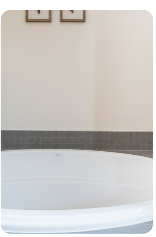
Big Sky 41 | Page 6 of 8