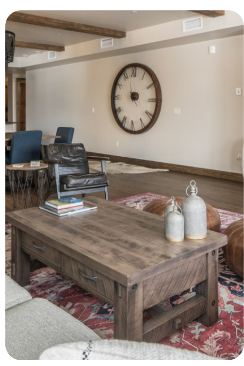
Big Sky 41 | Page 2 of 8