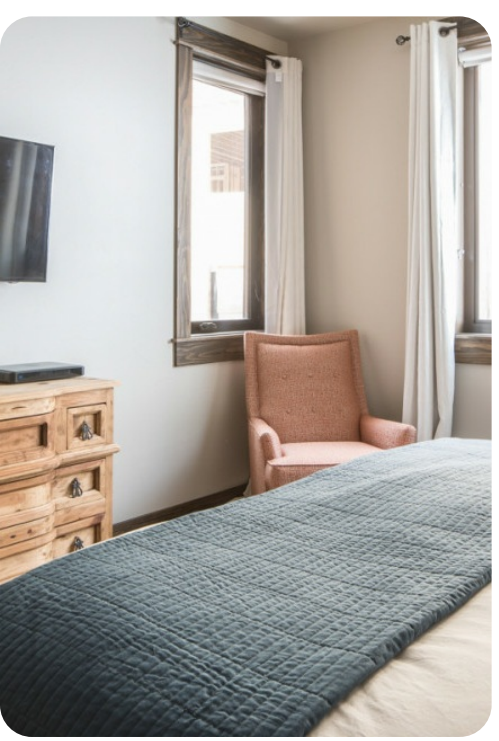
Big Sky 41 | Page 5 of 8