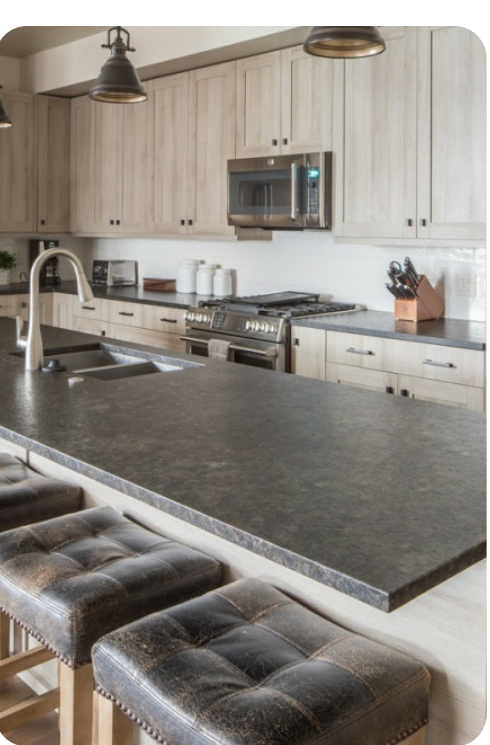
Big Sky 41 | Page 4 of 8