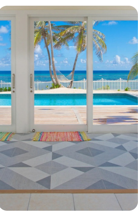
Babylon Reef | Page 4 of 7