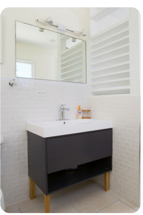
Babylon Reef | Page 3 of 7