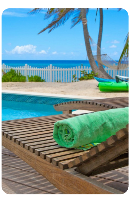
Babylon Reef | Page 6 of 7