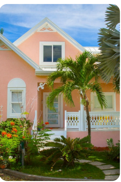
Babylon Reef | Page 5 of 7