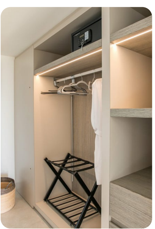
Avanti | Page 6 of 8