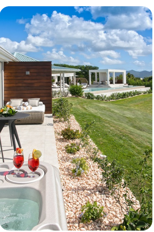
Avanti | Page 4 of 8