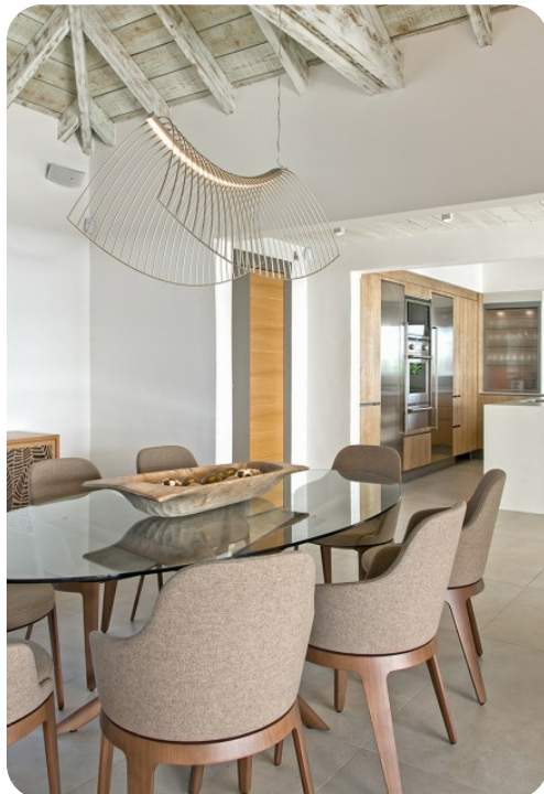
Avanti | Page 2 of 8