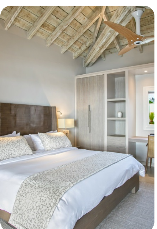
Avanti | Page 8 of 8