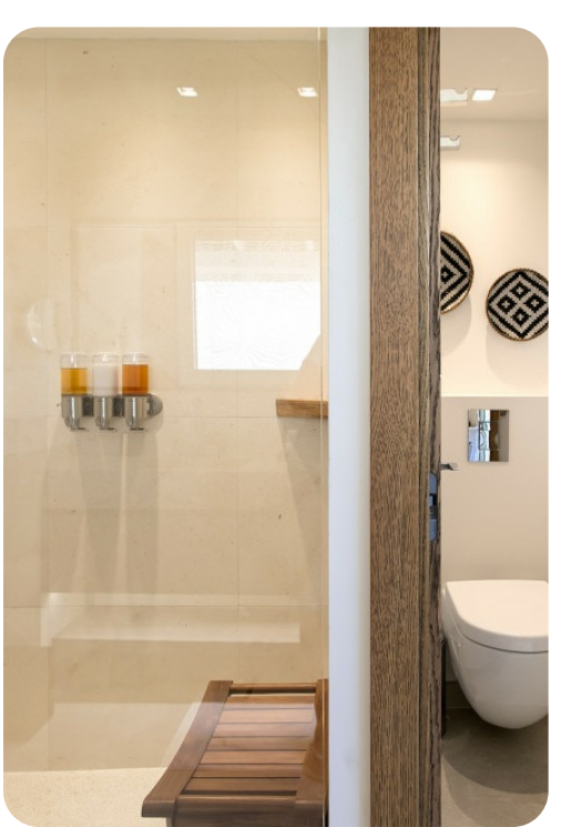
Avanti | Page 5 of 8