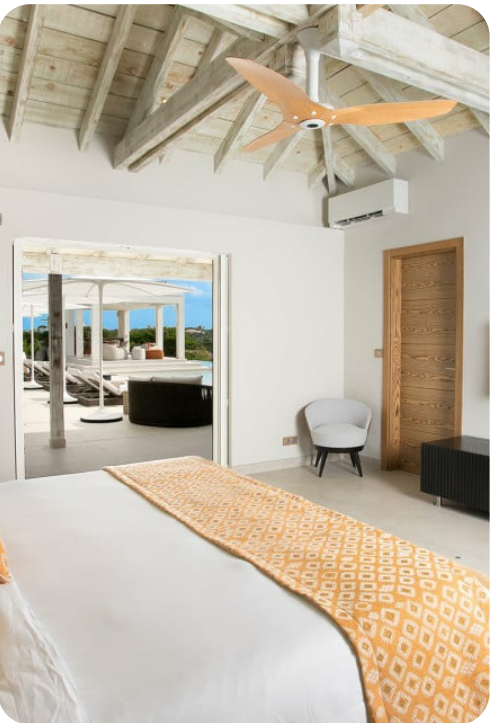
Avanti | Page 7 of 8