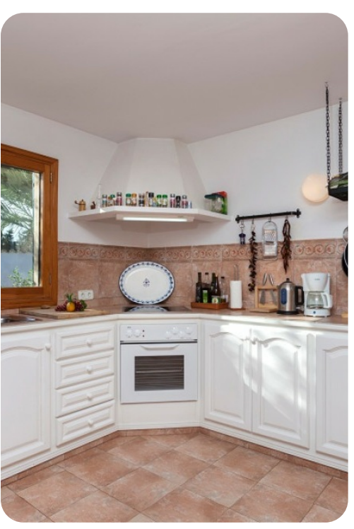
Aumadrava Gran | Page 2 of 5