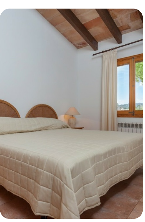
Aumadrava Gran | Page 3 of 5