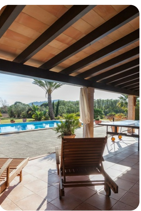
Aumadrava Gran | Page 4 of 5