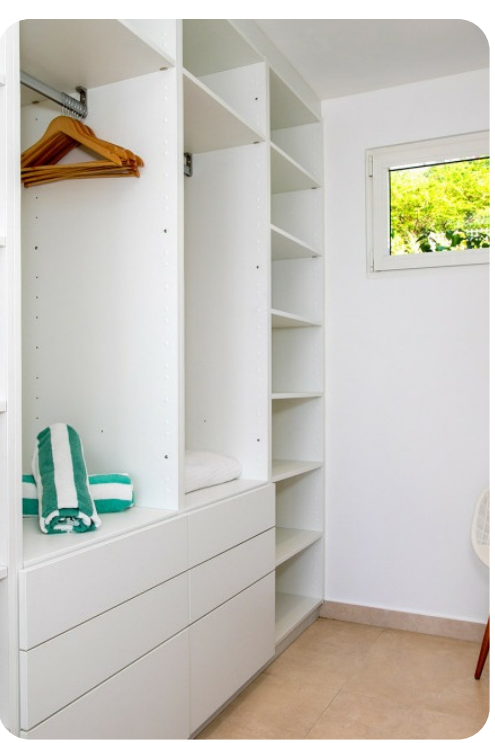
Aqua | Page 4 of 8