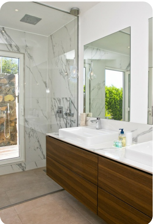
Aqua | Page 6 of 8