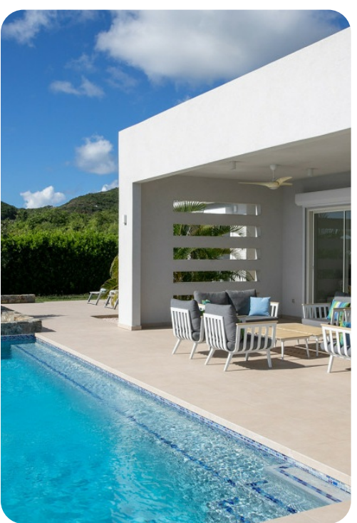
Aqua | Page 8 of 8