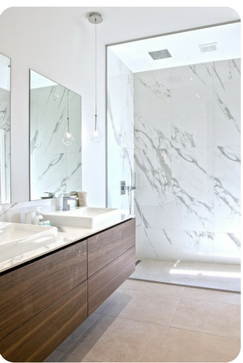
Aqua | Page 5 of 8