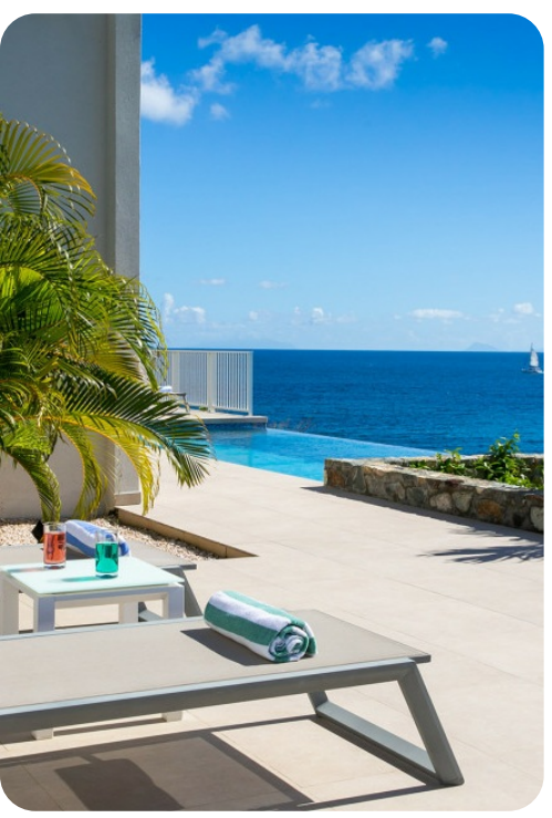
Aqua | Page 7 of 8