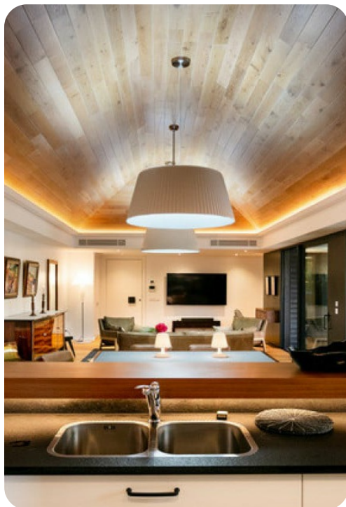
Apartment Gustavia Lights | Page 2 of 5