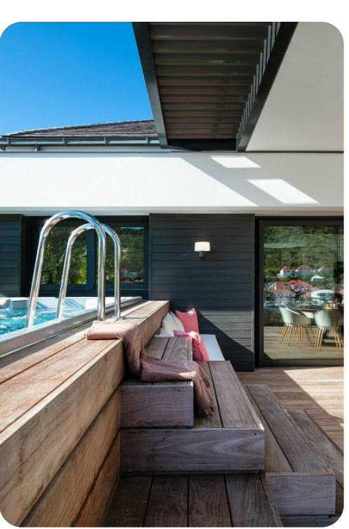
Apartment Gustavia Lights | Page 4 of 5