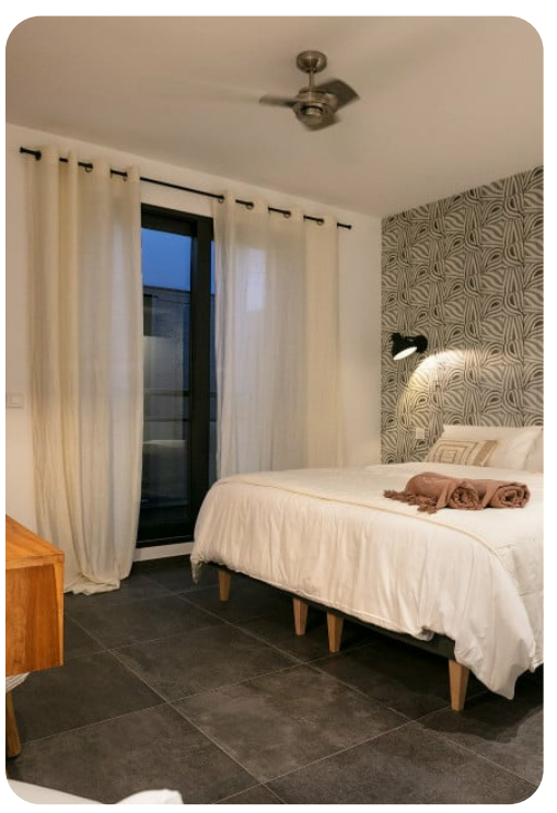
Apartment Gustavia Lights | Page 3 of 5