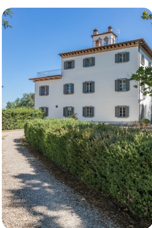
Antica Villa Merelli | Page 4 of 8