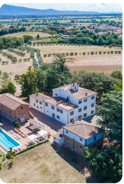
Antica Villa Merelli | Page 2 of 8