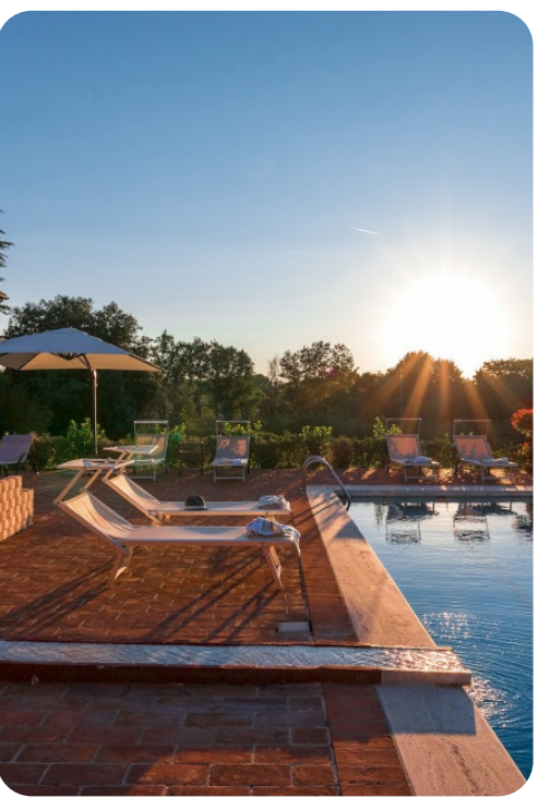
Antica Villa Merelli | Page 6 of 8