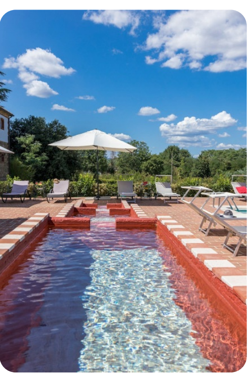
Antica Villa Merelli | Page 5 of 8