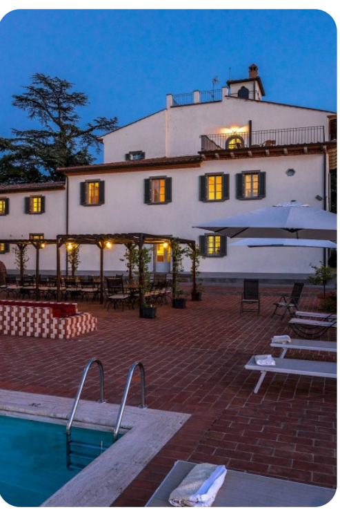
Antica Villa Merelli | Page 7 of 8