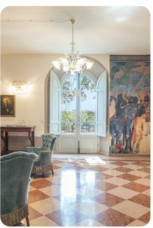
Antica Villa Merelli | Page 8 of 8