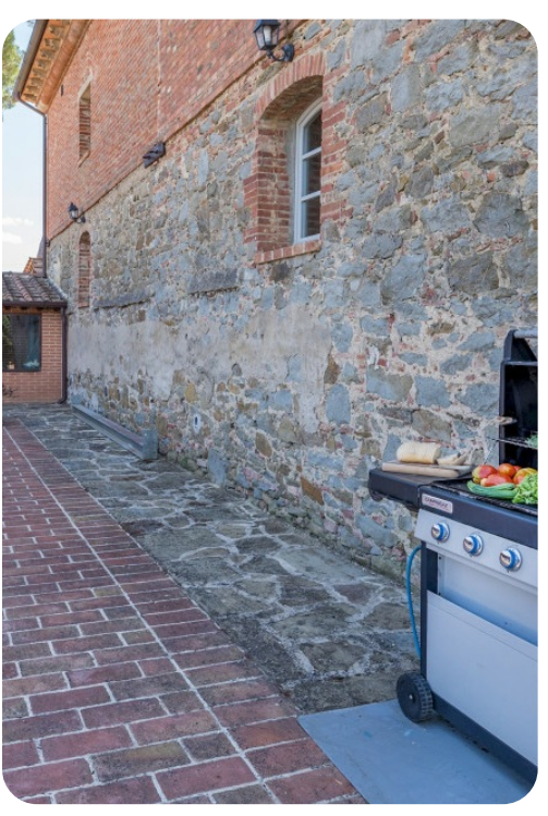
Antica Villa Merelli | Page 3 of 8