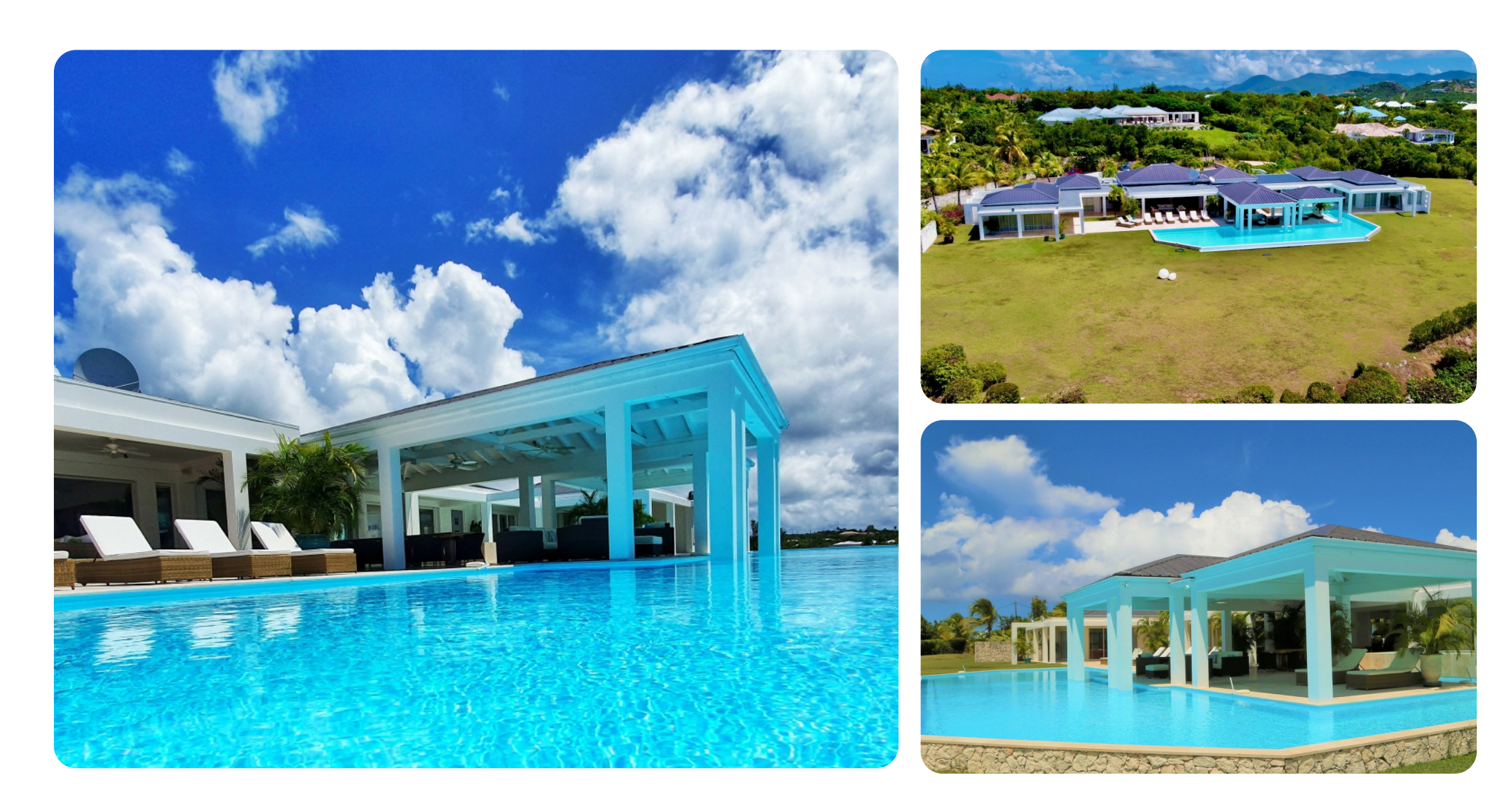
Image: width of the state interview Terres Basses Ambiance Image: width of the state interview Image: width of the state interview 4.5 Image: width of the state interview