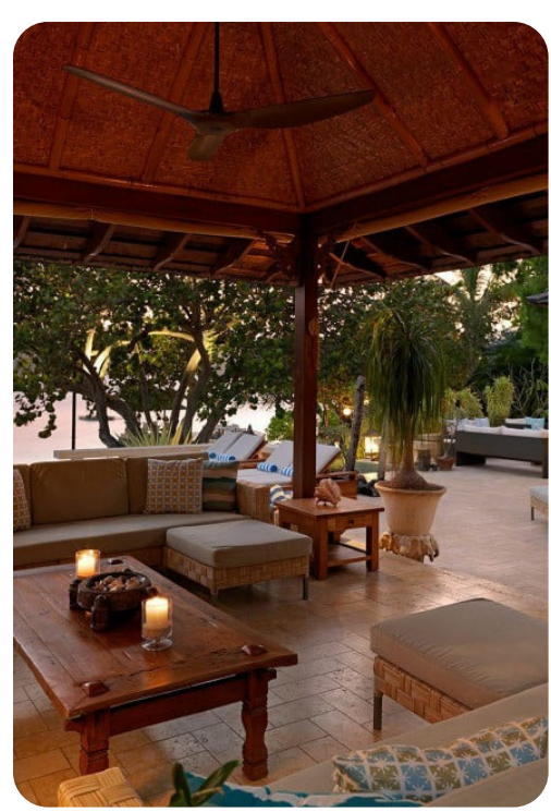
Amanoka on the Beach | Page 4 of 8