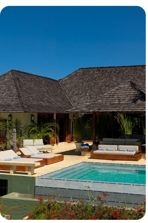
Amanoka on the Beach | Page 6 of 8 \,