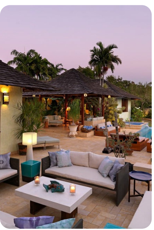
Amanoka on the Beach | Page 5 of 8 \,