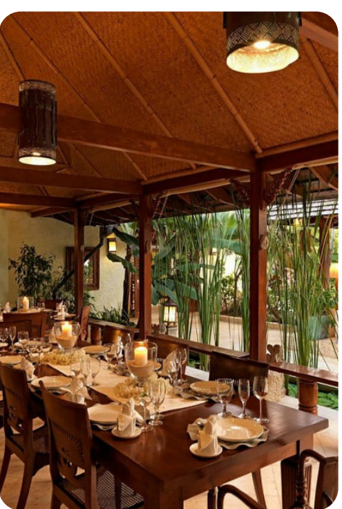
Amanoka on the Beach | Page 3 of 8