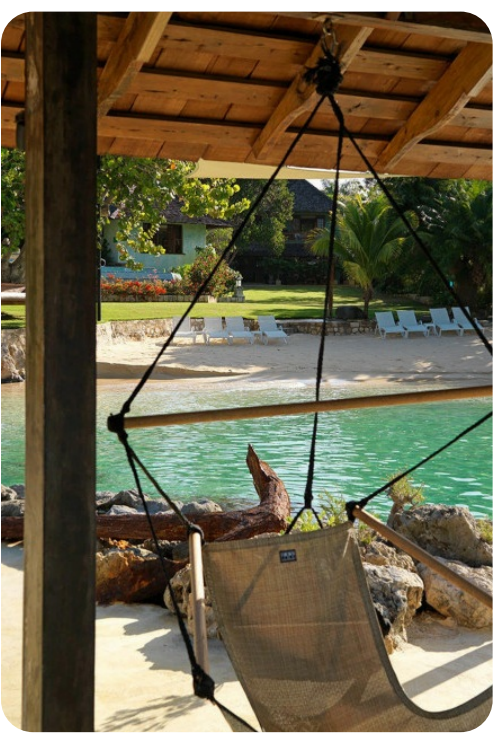
Amanoka on the Beach | Page 8 of 8