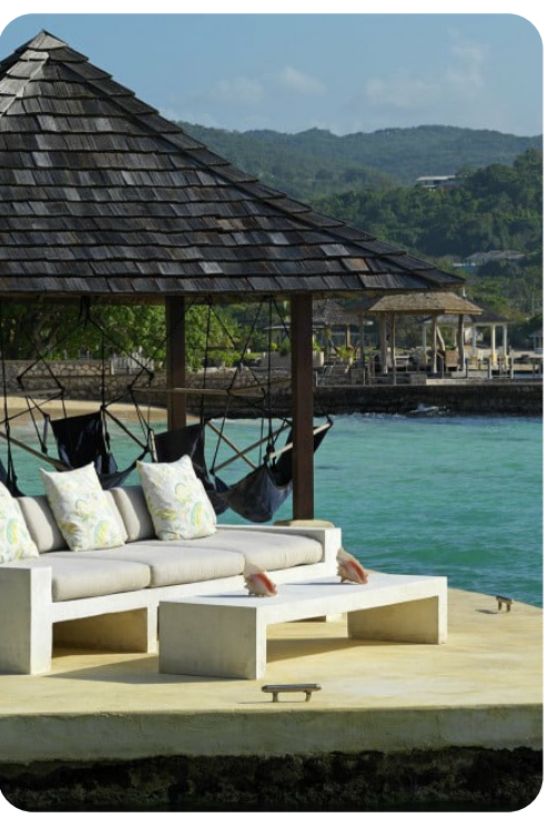
Amanoka on the Beach | Page 7 of 8 \,