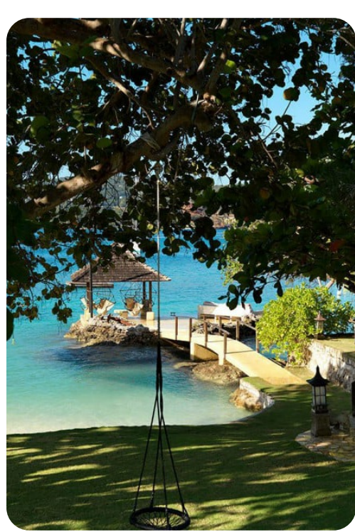
Amanoka on the Beach | Page 2 of 8