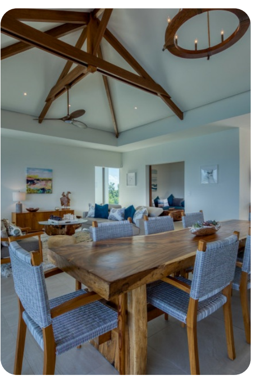
Amandara | Page 5 of 8