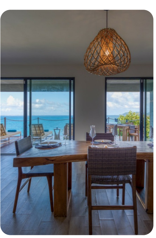
Amandara | Page 2 of 8