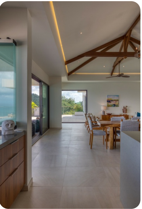
Amandara | Page 4 of 8