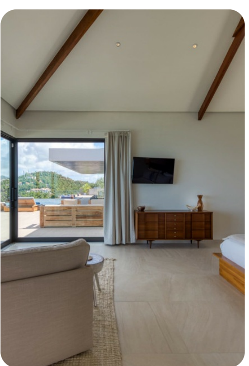
Amandara | Page 6 of 8