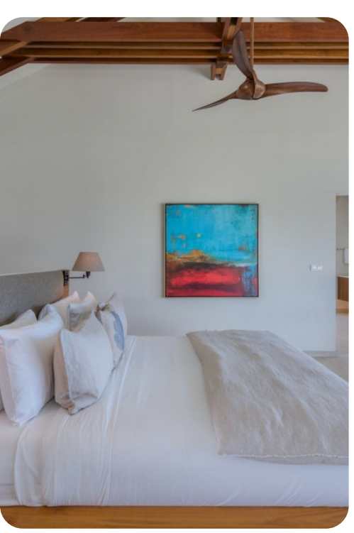
Amandara | Page 7 of 8