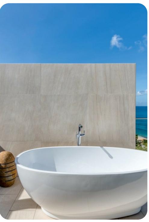
Amandara | Page 8 of 8