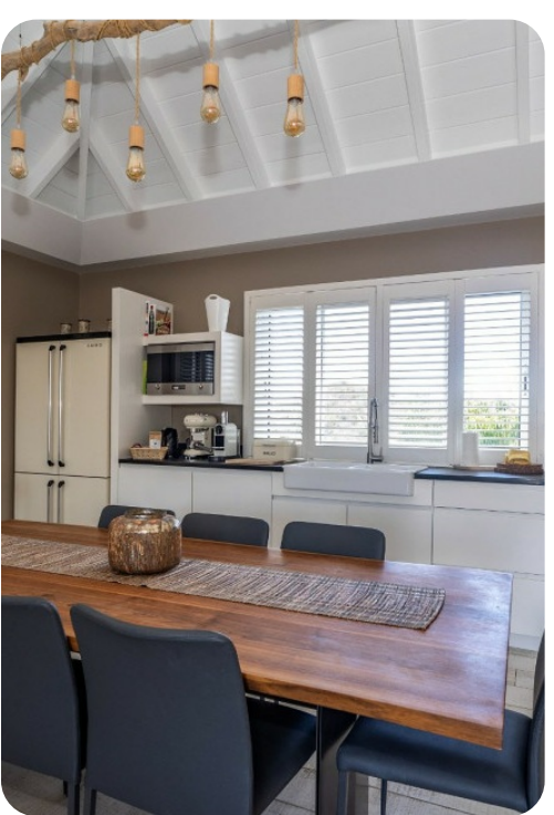
Always - Saint Barth | Page 3 of 8