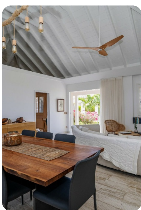
Always - Saint Barth | Page 2 of 8