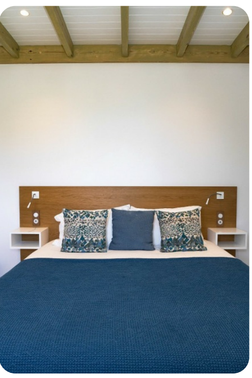
Always - Saint Barth | Page 8 of 8