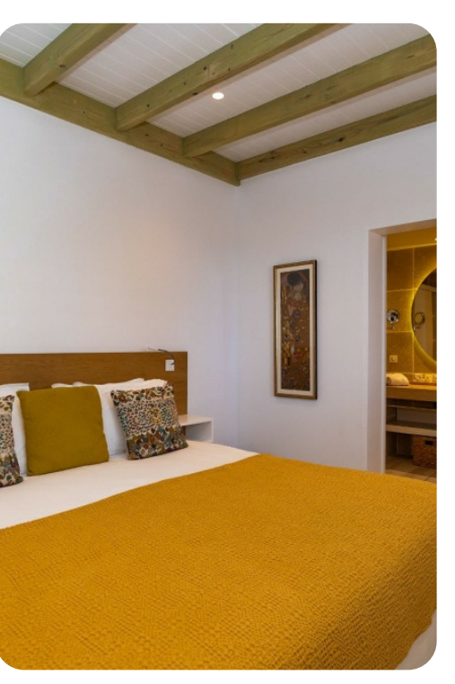
Always - Saint Barth | Page 6 of 8