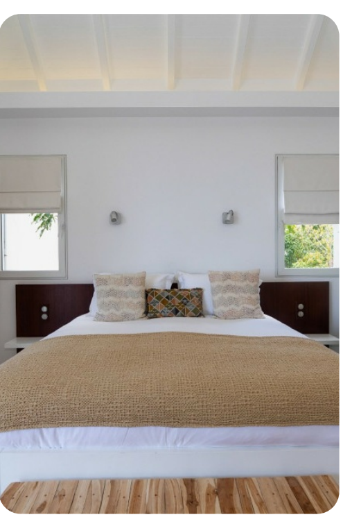
Always - Saint Barth | Page 4 of 8