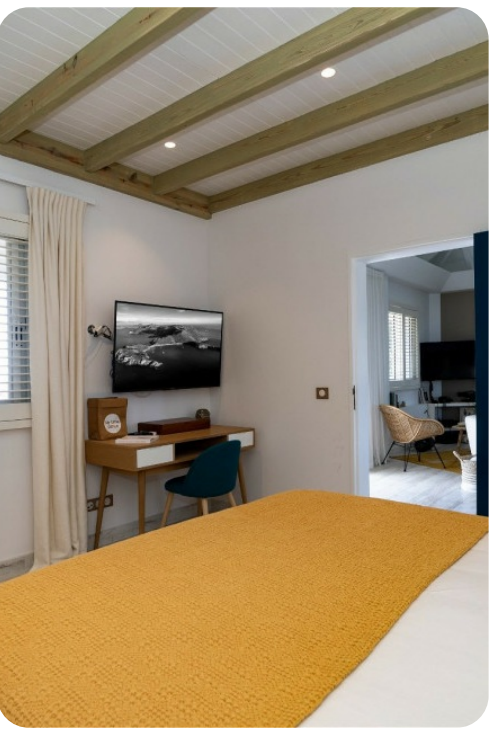
Always - Saint Barth | Page 7 of 8