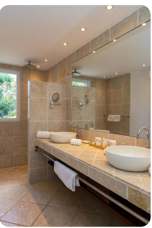
Always - Saint Barth | Page 5 of 8