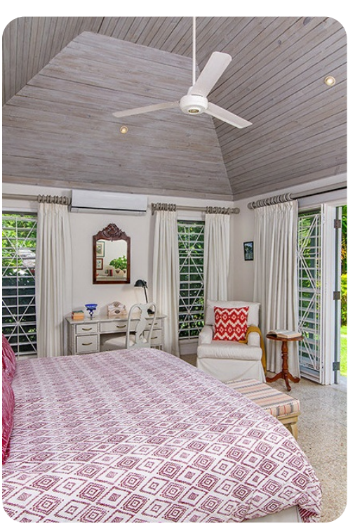
Almond Hill | Page 3 of 7