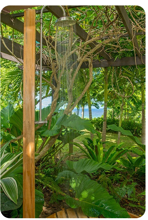
Almond Hill | Page 5 of 7