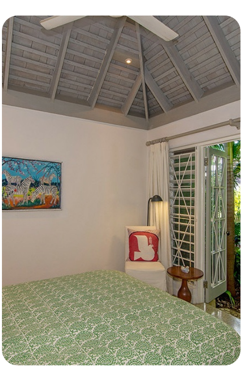
Almond Hill | Page 4 of 7