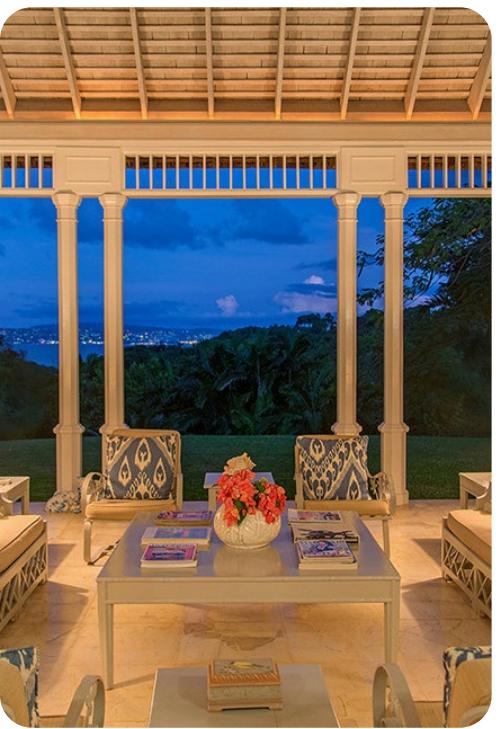
Almond Hill | Page 7 of 7