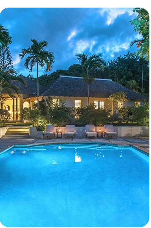
Almond Hill | Page 6 of 7