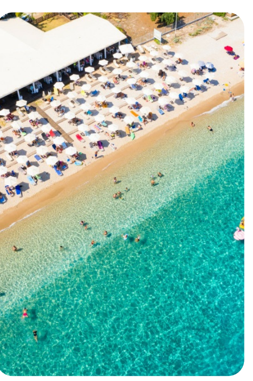
Alexandra | Page 8 of 8