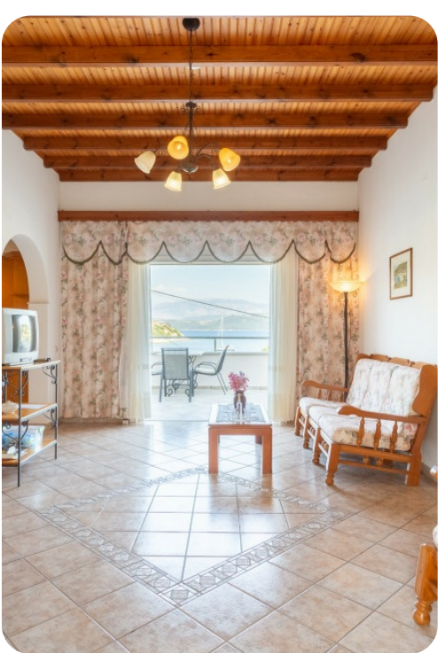
Alexandra | Page 3 of 8