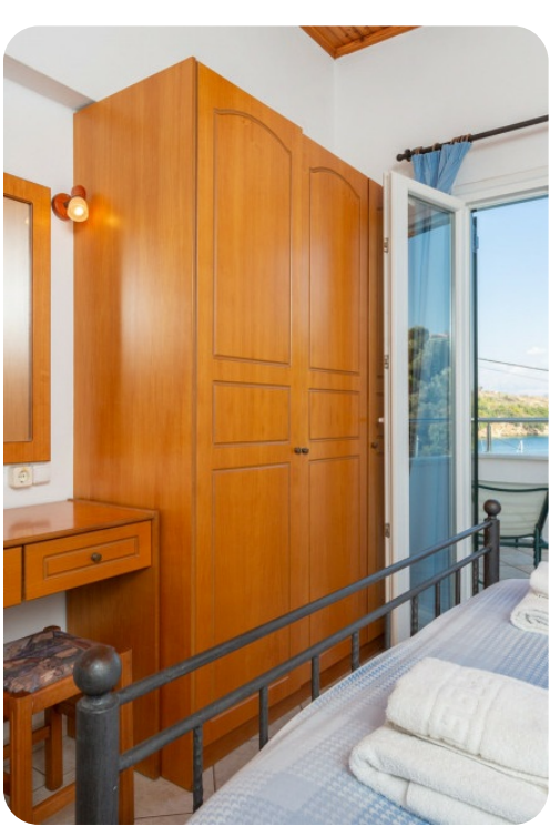
Alexandra | Page 5 of 8