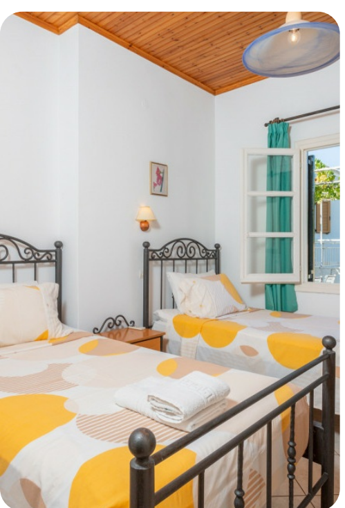
Alexandra | Page 6 of 8