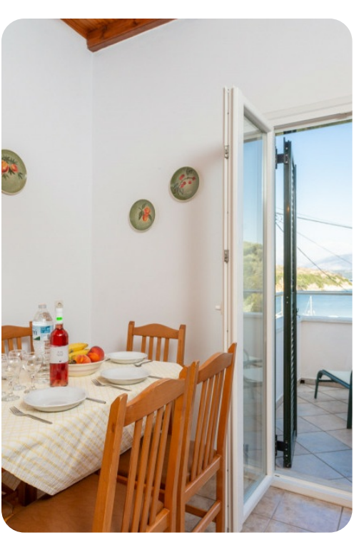
Alexandra | Page 4 of 8