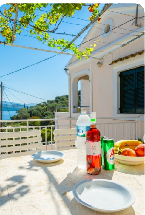
Alexandra | Page 2 of 8