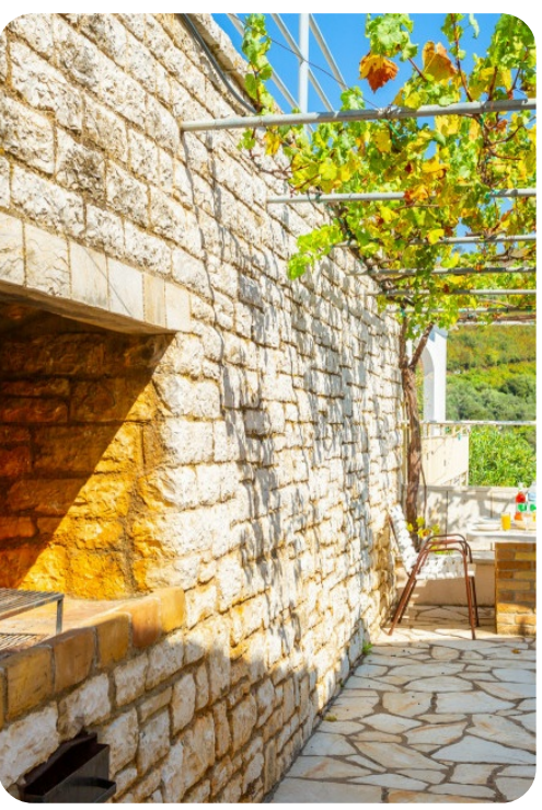
Alexandra | Page 7 of 8