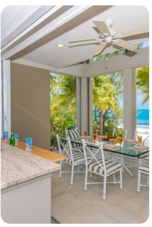
Abita Kai | Page 3 of 8