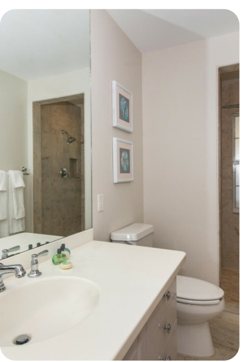
Abita Kai | Page 8 of 8