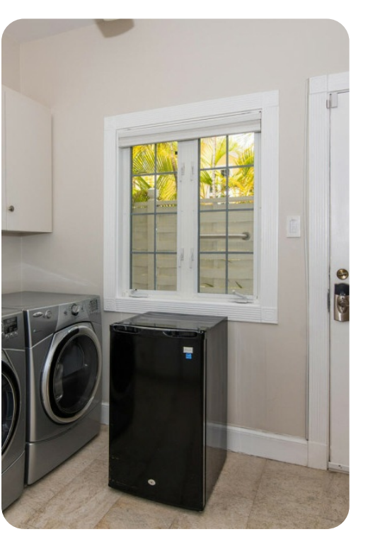
Abita Kai | Page 5 of 8