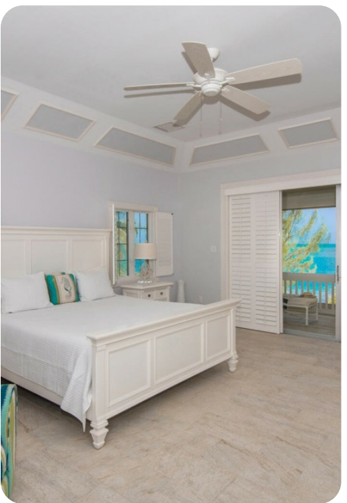
Abita Kai | Page 6 of 8