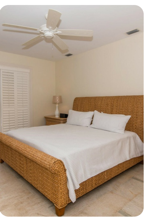
Abita Kai | Page 4 of 8