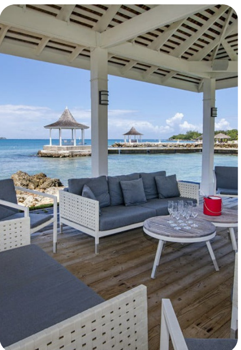
A Summer Place on the Beach | Page 4 of 8