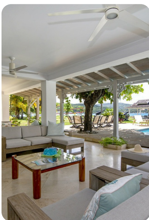
A Summer Place on the Beach | Page 3 of 8