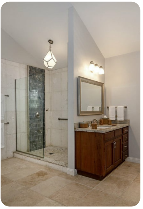
A Summer Place on the Beach | Page 6 of 8