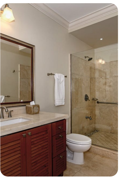
A Summer Place on the Beach | Page 7 of 8 \,