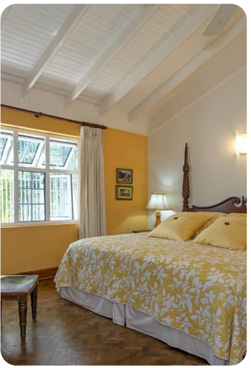
A Summer Place on the Beach | Page 8 of 8