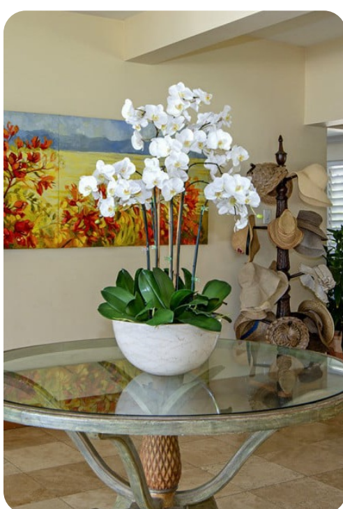
A Summer Place on the Beach | Page 2 of 8