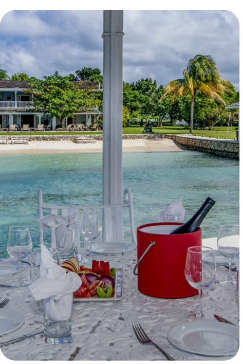
A Summer Place on the Beach | Page 5 of 8 \,