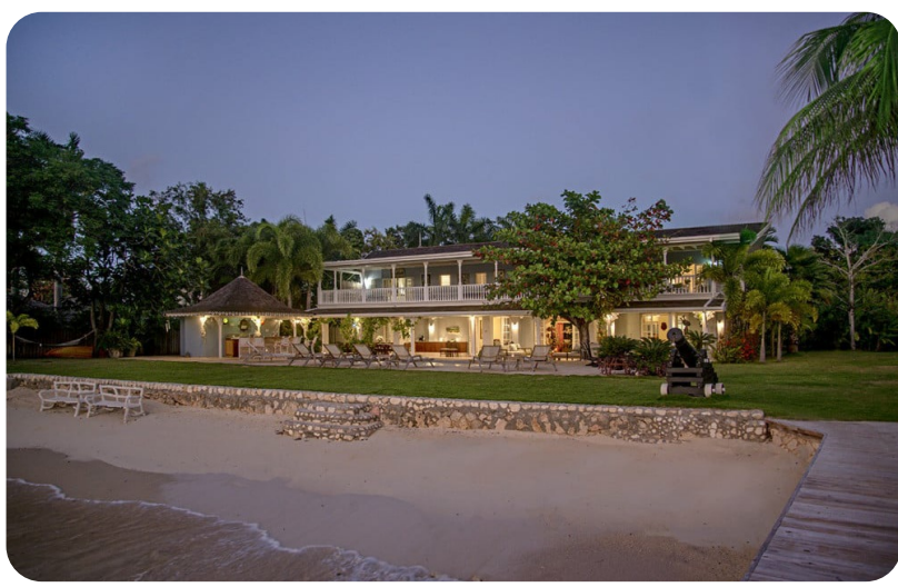
A Summer Place on the Beach | Page 1 of 8